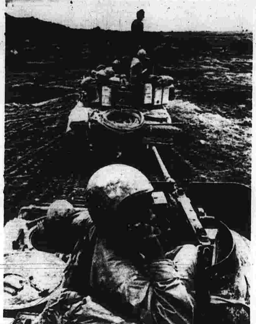
Commander of an American armored platoon passes the word to proceed as the vehicles prepare to leave U.S. Fire Base Alpha Four near the DMZ. Mission of the outfit was to set up defensive operations nearby.

The cease-fire was announced in the Jordanian capital a few hours after a guerrilla communiqué issued in Damascus and charged that Jordanian troops in tanks and helicopters were attacking guerrilla bases in the West Bank.